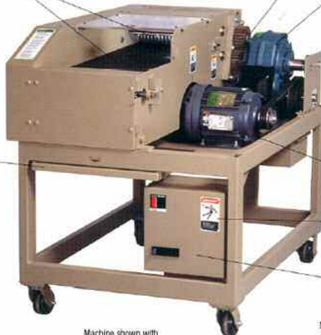
Machine shown with covers removed.

Allegheny paper shredders are designed and engineered for ease in maintenance and servicing. This ensures lasting performance with minimum downtime.